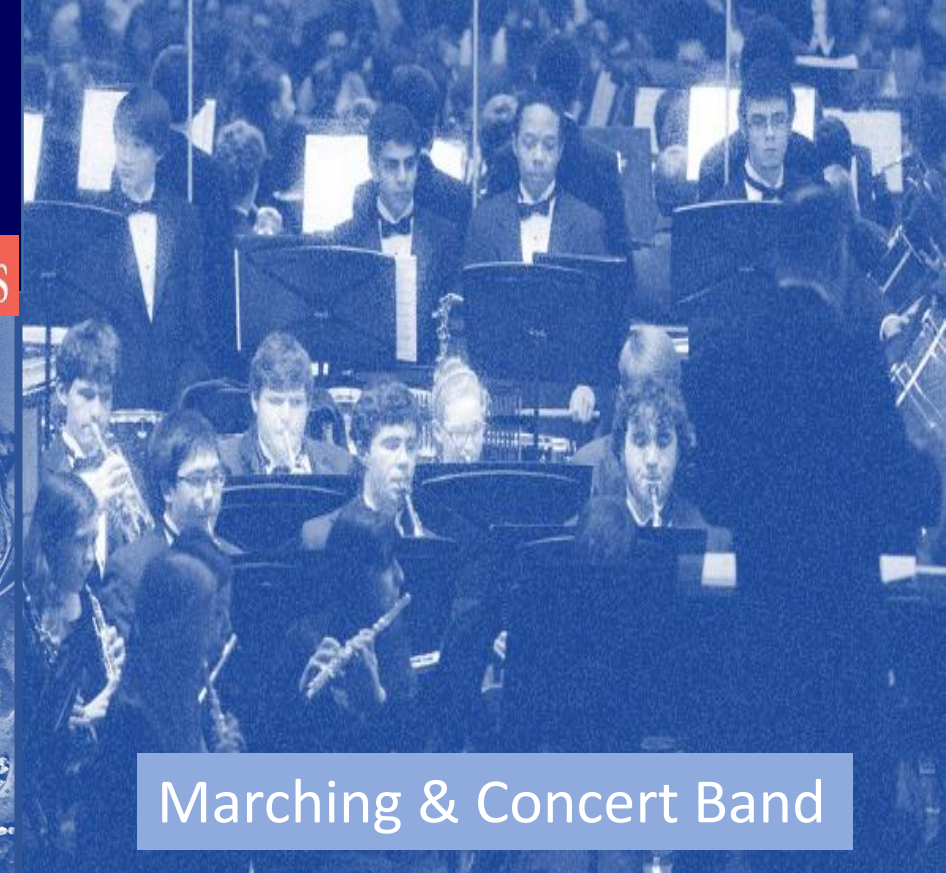
Marching & Concert Band